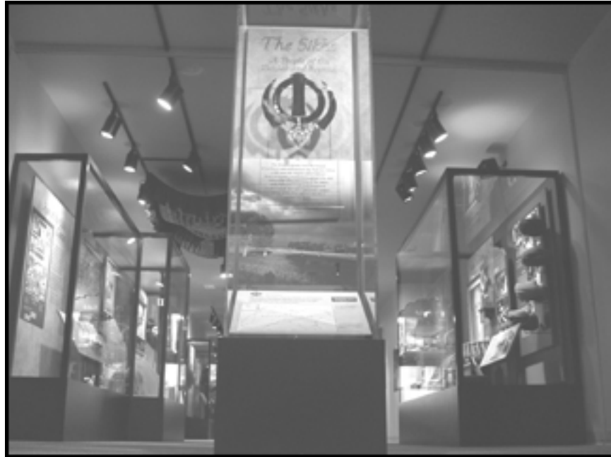
Figure 2. Entrance to the exhibition “Sikhs: Legacy of the Punjab” (July 2004).